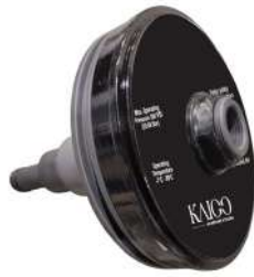
End Cap-8" - SP