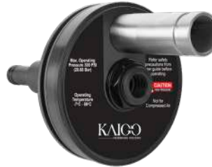
End Cap-8" - EP