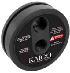
End Cap - 4"