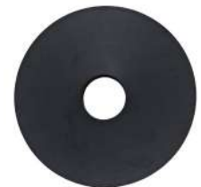
Seal Plate - 8"